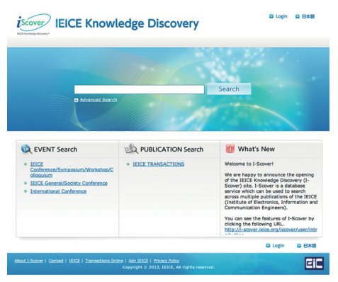
Fig. 1 View of the top page