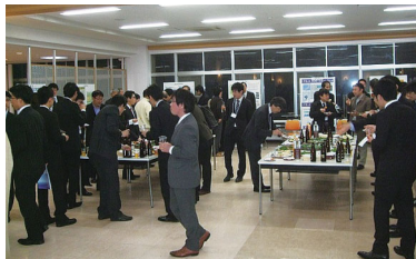
Fig.12 Welcome Party Participants enjoying talks each other