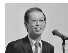
Fig. 4 Guest Speech addressed by Mr. Eiji Hamada, Deputy Mayor of Niigata city

The Conference also provided five complete English Sessions and encouraged the participation of not only international students and researchers staying in or visiting Japan but also domestic young generation for the enhancement of their global communication skills through presentation and opinion exchange in the campus. As a result of the evolving globalization scheme of IEICE, the number of English presentations has increased year by year even if gradually. This trend of evolving English based Sessions symbolizes the globalization scheme of IEICE.