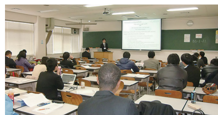
Fig. 8 Four Days English Session BS-1 organized by IEICE Technical Committee on Network Systems

NS will select the best papers and award a prize of the session in the near future to encourage their continuous activities. The best papers will be awarded in the upcoming NS Technical Committee meeting in October 2014. Your participation in the English Session by NS will be welcomed next year as well!