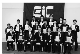
Fig. 1 Young Researcher's Award Giving Ceremony of each Society

and collaborations forward between the Conference participants covering staffs or students of the university through hosting the Conference, and the expected social contribution of the university (Fig. 3). Successively, Mr. Eiji Hamada, Deputy Mayor of Niigata City addressed a guest speech and referred to the historical role of the city which has promoted industries and communications with the marine transport represented by the northern bound ships "Kitamae-bune" which transported quite rich products from the sea and the paddy fields indispensable for daily lives (Fig. 4).