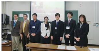
Fig.10 Award Winners in TJMW 2013 provide speeches