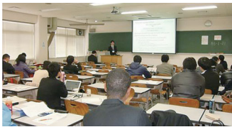
Fig.9 English Session CI-1 organized by IEICE Electronics Society

The radiation field distribution of the spherical dielectric resonator was simulated by solving eigenvalue equation for application to the antenna of wireless power transmission. It was found that the spherical dielectric resonator could be used as an antenna that radiated selected high-order mode spherical wave. There were many audiences in the presentation room, and they celebrated the award winners.