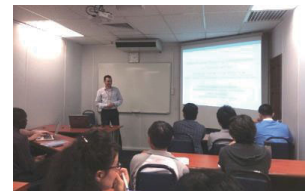
Fig. 2 My presentation at CyberSec2013 International Conference held in Malaysia