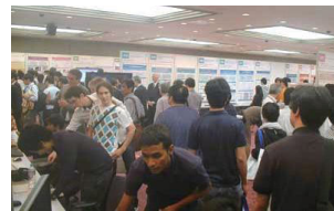
Fig. 1 With the participants in National Institute of Informatics (NII) Open House

The paper presentation in international conferences is very useful in the sense of accelerating the research for better solutions (Fig. 2). The relevant IEICE Technical Committees and Conferences have been effective for the promotion of my research activities as well.