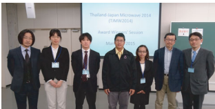
Fig.3 Speakers (Award Winners in TJMW2014) and Session organizers in Session CK-2