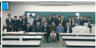
Fig.5 TK-2 Speakers with I-Scover Project members