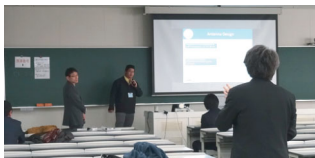
Fig.2 Question and answer after a presentation in Session CK-2 organized by IEICE Electronics Society