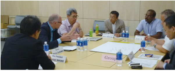
Fig. 2 Group Discussion (Group 1)