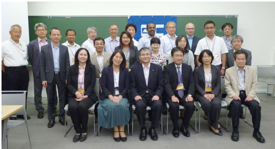
Fig. 1 Participants of ASM

She also stated her expectation to the International Sections on three aspects: