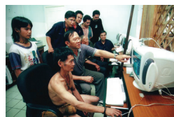
Fig.1 Frontier inhabitants join e-Bario activities.

Up to date, the e-Bario project is internationally recognized by many institutions. It has received awards including the Industry Innovators Award for Systems Development and Applications by Society of Satellite Professionals International (2002), Prime Minister’s Information Technology Award (2003), eASIA Award for the Bridging the Digital Divide