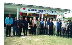
Fig.2 Launching e-Bario Project with local representatives.