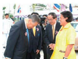
Fig.1 At Opening Ceremony of TNI (from right, HRH, myself, the former PM of Japan)

In June 2009, the institute comprises three faculties and a