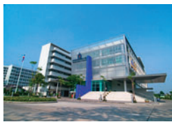
Fig.2 Evolving TNI

planned admission (Fig.3). Thus, I think you could know how TNI was born, with the strong passion and determination of many Monbusho scholars and TPA staff and board members, together with the help, understanding and generous support of JTECS. But this is only the beginning of TNI, through generous support, strong cooperation and collaboration with institutes of Japan. I believe TNI will become a leading university in science and technology in the near future, and be a symbol of cooperation, understanding and friendship between Japan and Thailand.