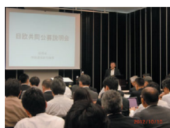
Fig. 6 Participants listening to the public offer of NICT's Research Projects for EC's FP7-ICT-2013-EU-Japan