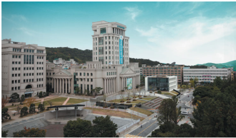
Fig. 1 Seoul Campus of Hankuk University of Foreign Studies

Hankuk University of Foreign Studies (HUFUS) is a leading global institution established in 1954. As 'Hankuk' (meaning Korea) implies, it is recognized as the best university not only in Korea, but also in the world educating foreign languages and regional studies. The mission of the university is to foster creative experts with global mindset in the international stage who can contribute to the world peace and exchange of cultures (Fig. 1).