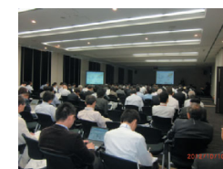
Fig. 5 Symposium venue filled by many participants over 170 people