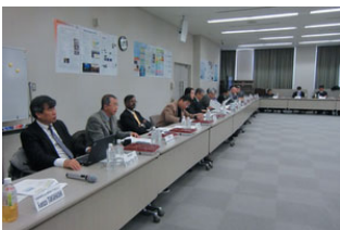
Fig. 9 International Sec. Repr.'s who attended the Meeting