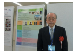
Fig. 2 Prof. Yasuharu Suematsu, Japan Prize laureate at the poster corner of International Sections