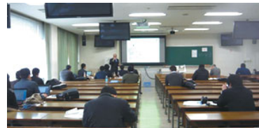
Fig. 11 Four Days English Session BS-3 organized by IEICE Technical Committee on Network Systems

NS will select the best papers and award a prize of the session in the near future to encourage their continuous activities. The best papers will be awarded in the upcoming NS Technical Committee meeting in October 2015. Your participation in the English Session by NS will be welcomed next year as well!