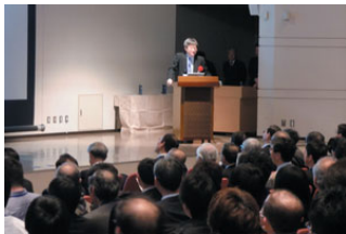
Fig. 7 Keynote Speech given by Prof. Hiroshi Amano, 2014 Nobel Prize laureate.