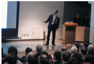
Fig. 8 Keynote Speech given by Prof. Shuji Nakamura, 2014 Nobel Prize laureate.

has increased year by year so far, but it tended to slump down in average.